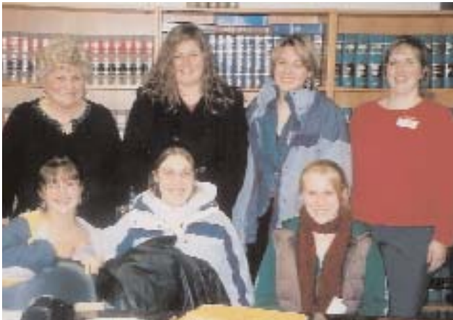
Key Club Executives Training

Thank you to those who were able to volunteer their time!